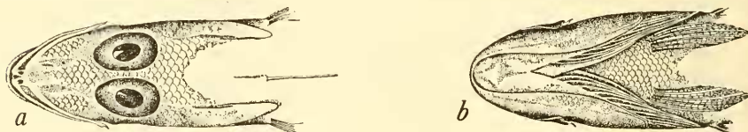
FIGURE 122.— Bembrops gobioides : a , dorsal aspect of head; b , ventral aspect of head; mandible more extensively scaled than shown in figure. (Both from Goode and Bean.)

pattern made up of the prominent outlines of the scale pockets. Some specimens show two or three faint dusky smudges along lateral line. First dorsal usually black or dusky for its anterior upper and greater part, hyaline basally and posteriorly, often dark nearly all over; second dorsal moderately dusky margined with blackish and a basal blackish area at its anterior part; anal moderately dusky, rather narrowly margined with black, often dusky or black nearly all over; caudal dusky, usually with a rather wide black area at its distal end, and a dark area at its upper margin and in juxtaposition to the caudal